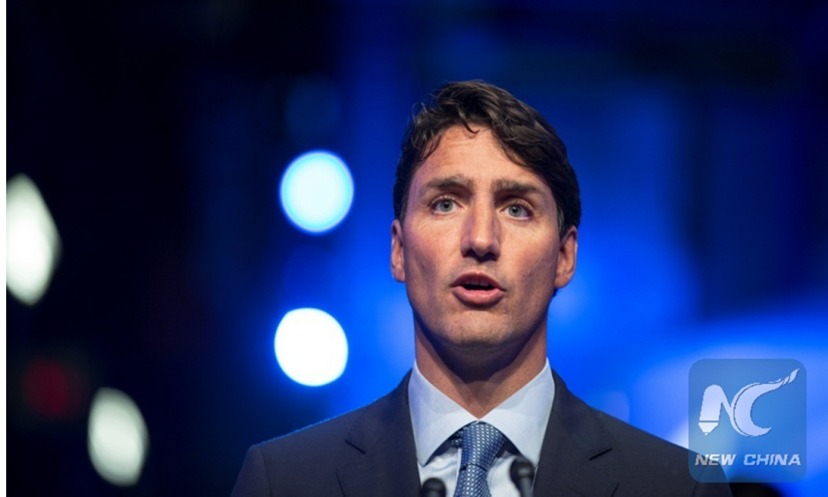
Canada's Prime Minister Justin Trudeau answers questions from the media in Montreal, Quebec, Canada, August 8, 2018.

The case of Huawei Chief Financial Officer Meng Wanzhou has long been an issue that has hindered the development of China-Canada relations. Now that Meng has returned to China, it is indeed an opportunity for both sides to calmly think about their bilateral ties, which, however, will not be so easy to restore.